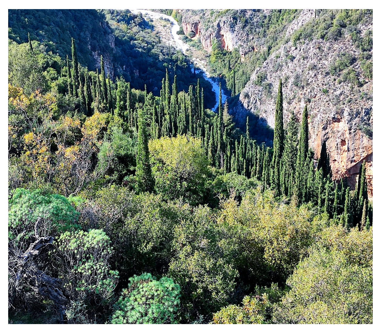
Cypress trees overlooking the Viros Gorge, near Kardamyli

Day 4 Thursday 03/04 - we head south, along the Mani peninsula, to Cape Tainaro, one of the gates to the underworld, according to Greek mythology. It's unlikely we will encounter Charon, but if we are lucky we may spot Tulipa goulimyi and Fritillaria davisii . Keen walkers may follow the track leading to the lighthouse at the tip of the peninsula where, standing at the most southerly point of mainland Greece, they can take in the endless expanse of blue, stretching all the way to north Africa. Others may prefer to explore the Roman mosaics, and visit the sanctuary of Poseidon. The really hardy may be tempted to swim from the small beach! The next stop is Areopoli, where we make our way through cobbled alleys for lunch in a traditional taverna, passing the square where the banner of the Greek Revolution was first raised, in 1821. From here we will head north to our base for the next four nights, the pretty seaside town of Kardamyli, mentioned by Homer in the Iliad, and one of the oldest settlements in the Peloponnese. It has spectacular views of the Taygetos mountains to the east, and the Bay of Messinia to the west.