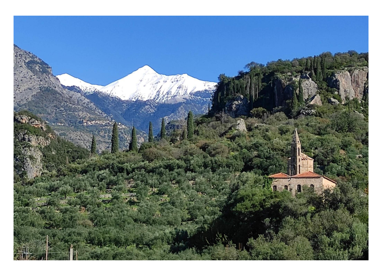
The peaks of the Taygetos mountain range, viewed from the outskirts of Kardamyli.

Early spring is arguably the best time of year botanically, when the hillsides are awash with colourful wildflowers, punctuated by acid green Euphorbia and splashes of Anemone . We will visit the three fingers of the southern Peloponnese, to explore sites of both horticultural and architectural interest, botanising among atmospheric ancient ruins colonised by chasmophytes, and invariably set in spectacular, rugged landscapes, which perfectly epitomise the principle of genus loci.